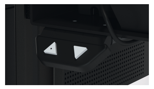
The motorized height adjustment DisplayLift with four castors is easy to move. Cables and KLICK&SHOW are elegantly integrated. Thanks to the Rear Cover, the display holder is not visible.